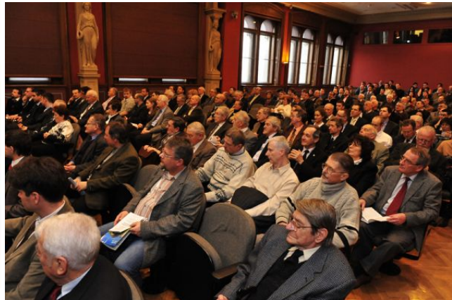
Participants of the Memorial Lecture